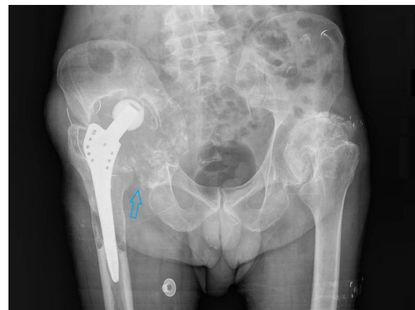
Figure 1. Plain bilateral hip x-ray in AP view with important signs of bone resorption of the right coxofemoral joint (arrow).

We present the case of a 66-year-old patient, recently diagnosed with bladder carcinoma after a haematuria study, with a picture of lameness and a painless right groin mass, of hard consistency on palpation. As personal background, we highlight a total right hip arthroplasty a few years ago due to severe osteoarthritis. The AP bilateral hip X-ray showed significant bone destruction of the right coxofemoral joint (Fig. 1). In light of these findings, an ^{18}\text{F} -FDG PET CT was performed as an extension study of the primary bladder neoplastic process, with the possibility of metastatic bone involvement. In the images at 60 min post-injection of ^{18}\text{F} -FDG a large mass of hypermetabolic multi-lobed soft tissue was observed in the right iliac region, which included the prosthetic material and produced lysis of the iliac wing, with significant destruction of the coxofemoral joint (Fig. 2). A biopsy was performed in view of the findings indicating malignancy, the result was particle disease due to wear and tear of the arthroplasty components. The patient refused surgical revision and is currently undergoing regular follow-up.